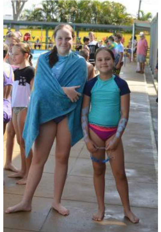
Students enjoying the warm weather and friendly competition at the Annual Swimming Carnival held at Macksville Aquatic Centre.