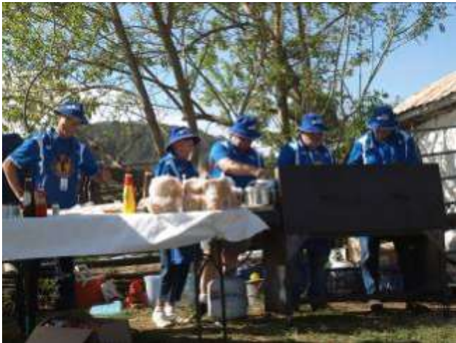
BBQ at Bakers Creek WRC Spectator Site.

We also ran a Tyre Change and it was a lot of fun. Thanks to Eastland Holden for supplying the car and to Rally Australia, Norco and the Ex-Services club for the prizes.