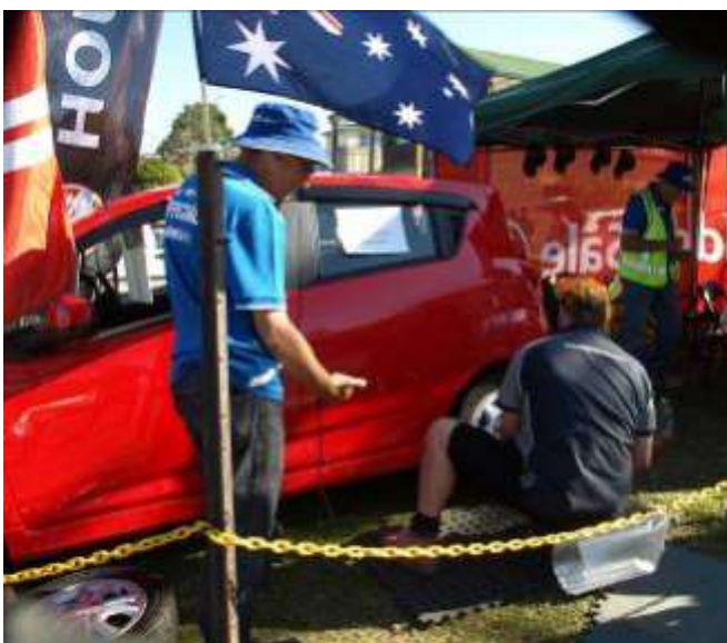
Tyre Change competition, Bowraville.