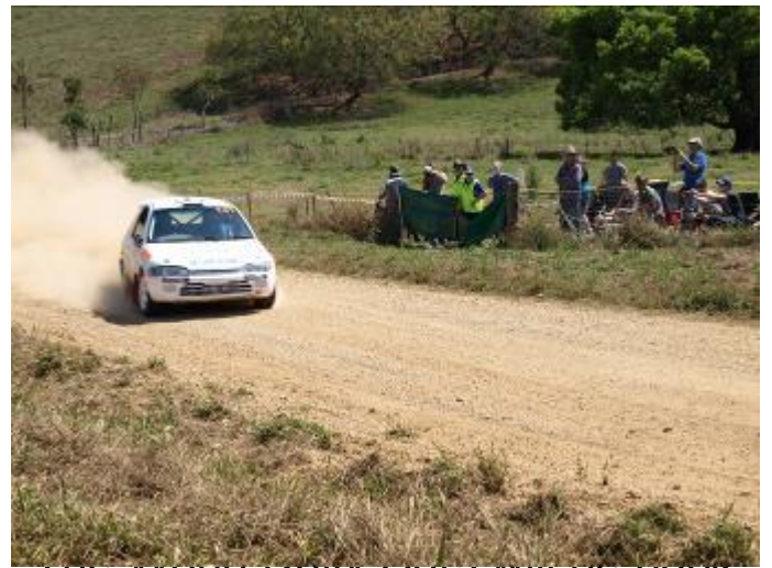
in Bowraville on Saturday 19th November

Tickets will be on sale via Ticketek from 1st July 2016