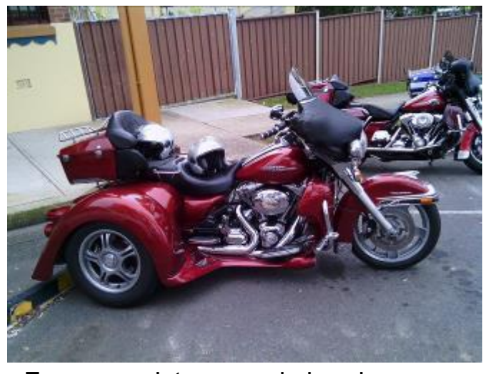
For more pictures and chamber news visit the chamber page on Facebook

On Sunday May 1st the Harley Owners Group Mid North Coast visited Bowraville